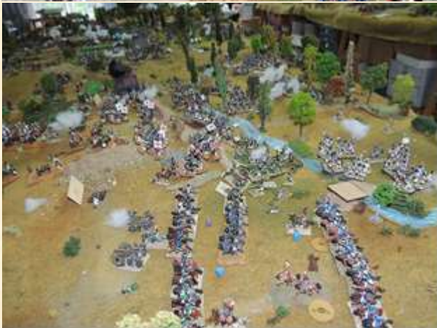
The Italians fleeing, the heroic counter attack led by Bagration (with 70% casualties!).