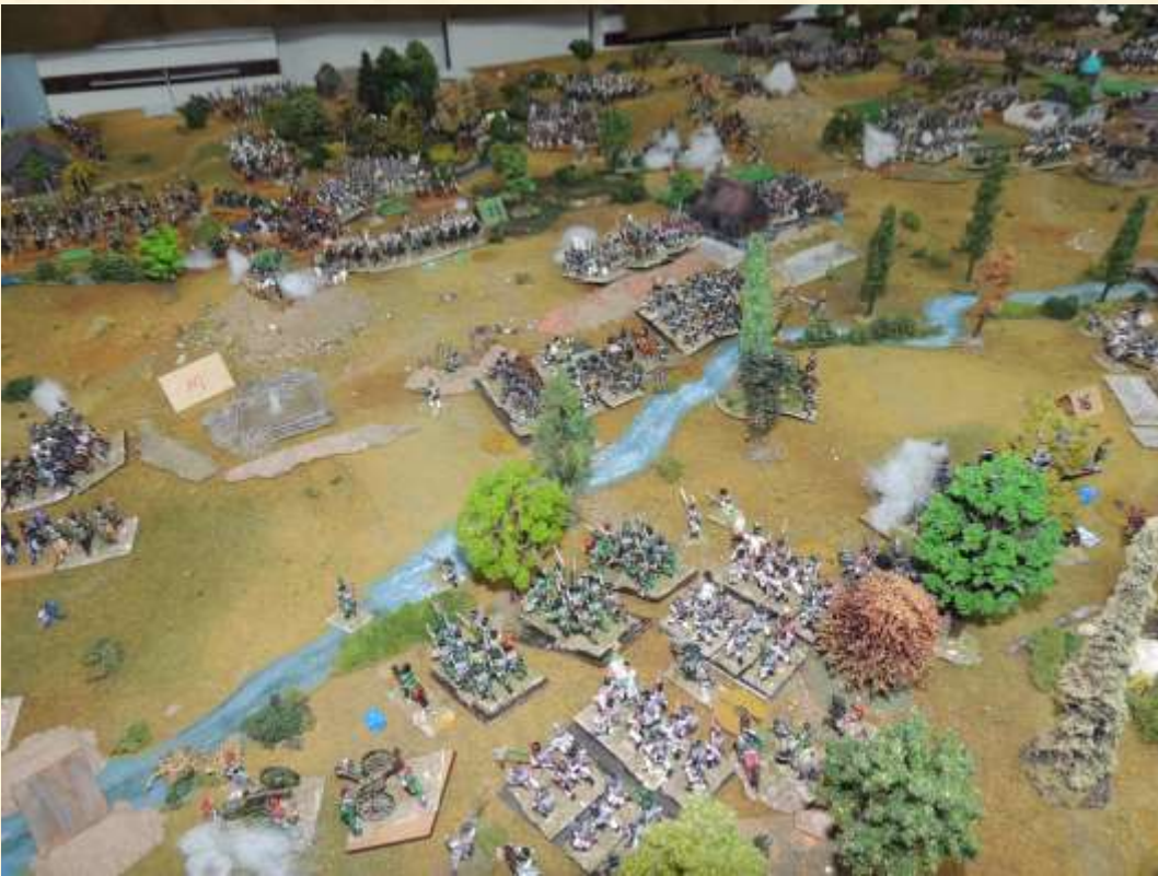
Italians coming in