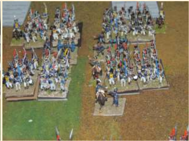
The Vistula legion.