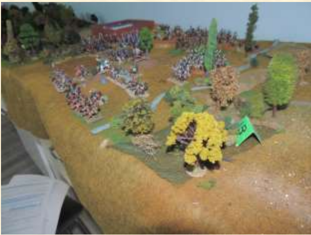
The right cavalry finally cleared out.