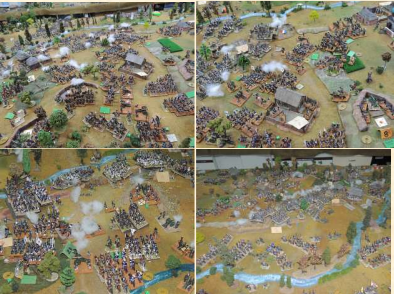
The high mark of Eugene corps...

My Russian deployment was faulty and both sides had their reserve way too far back. It was mighty, fun and a lot of work, will do it again.