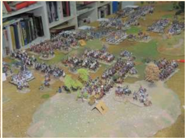
French reserves, guards etc. Bessières'