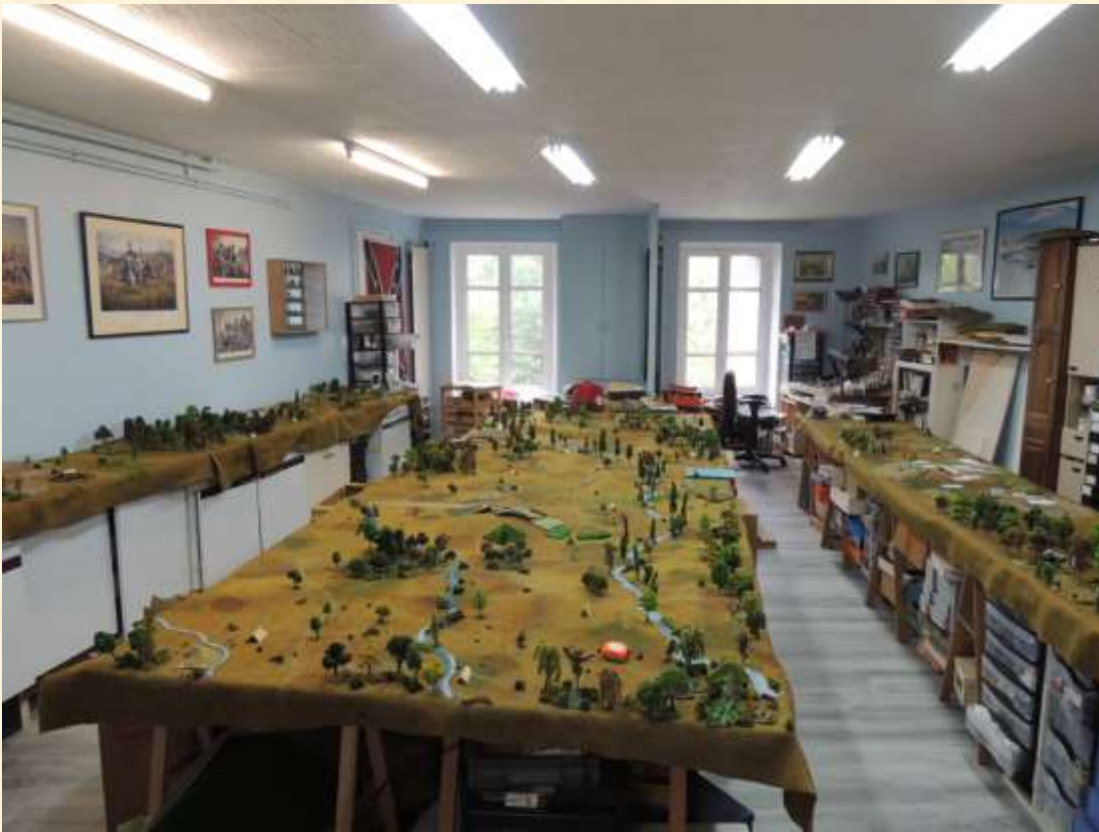
from 2019 game