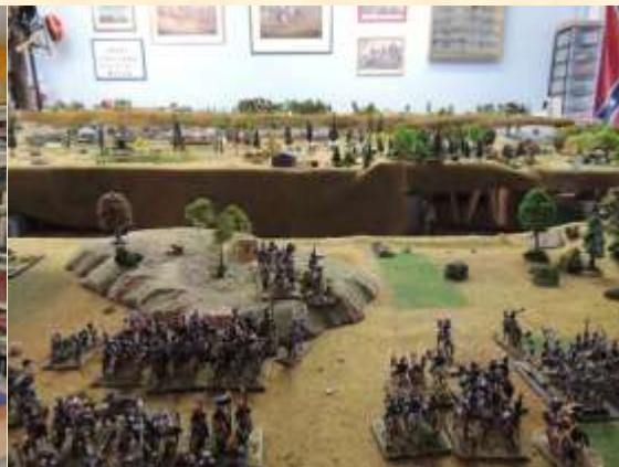
What the Corsican sees.